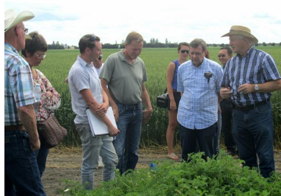
Forage Crop Research Tour 2016